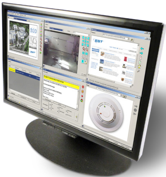
Your compass: EST3's FireWorks Graphical Command Interface.

This means, for example, that during an emergency your system operator can broadcast audio instructions, view live CCTV, and disarm security partitions in order to provide occupants with unencumbered egress – all without taking his or her eyes off the system display. Only Synergy-enabled EST3 with mass notification merges emergency communications with threat detection – and security control – to offer this level of crisis management.